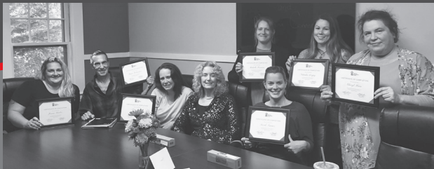
Our 2019 REACH Project Graduates

Participants chart their path to success through mindfulness practice, individualized coaching and goal setting.